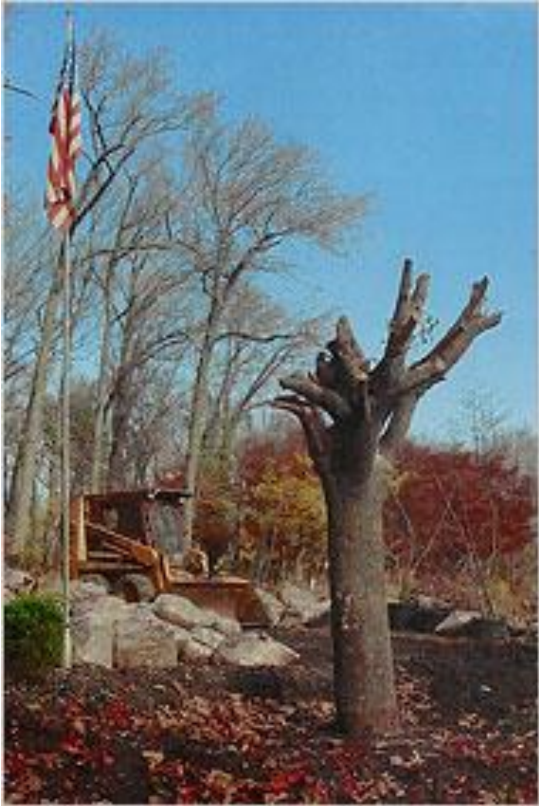
Attachment B The Survivor Tree 2001